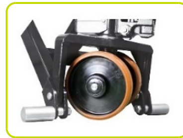
PHOTO AUTO LEVELING SYSTEM

Rear stabilizers, in turn, render work stable and safe even in the case of elevated loads once the 400 mm of lifting up have been exceeded.